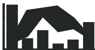
Exhibit 3 Percent Changes in Employment From Pre- to Post-Treatment by Group (N=892)